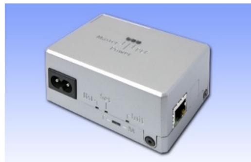
Evaluation Kit example