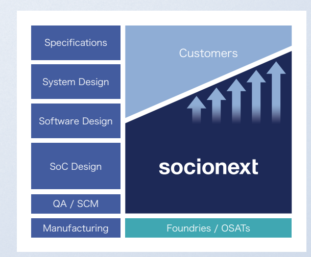
Leader in "Solution SoC"

To meet such customer needs in the fast-changing market, Socionext acts as a "Solution SoC" company that delivers differentiated SoCs by being involved from the concept stage, then proposing the optimal choices and the best combination of components in the design ecosystem. This unique business model provides our customers distinct value that many conventional ASIC providers who focus mainly on logic synthesis and physical design aren't able to offer.