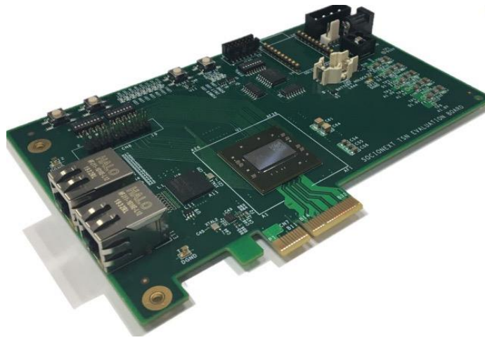
TSN IP Evaluation Board